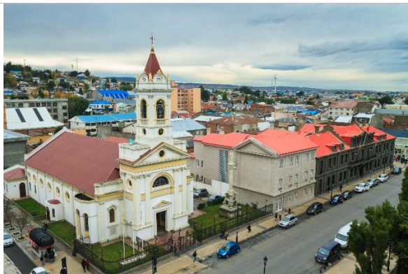
Punta Arenas city (main square) from high